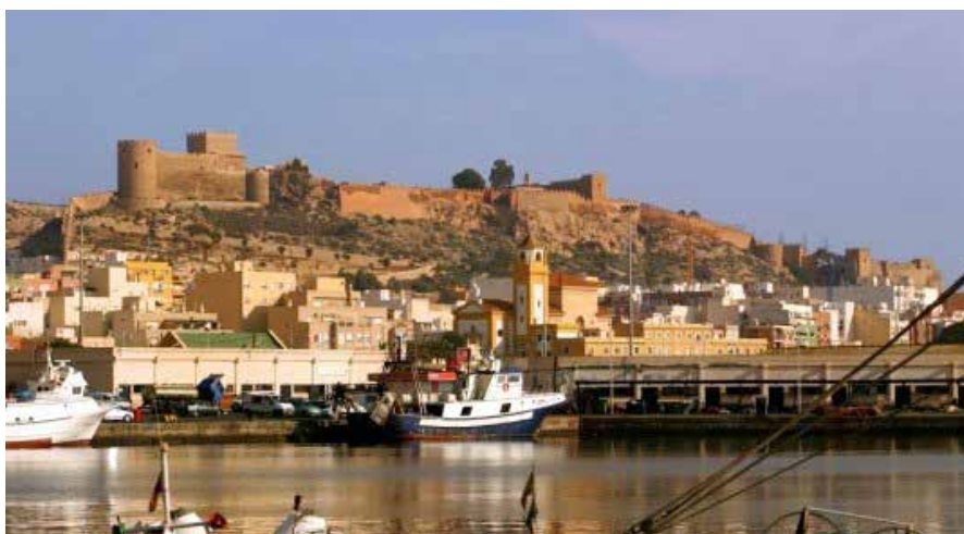
Panoramic view of the Alcazaba of Almería