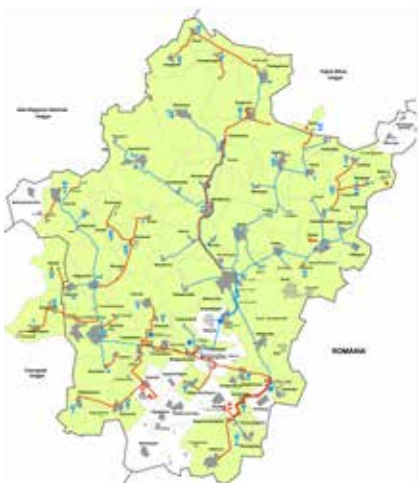
The pipeline network in Békés County. Blue lines are the old, red ones are the new pipelines