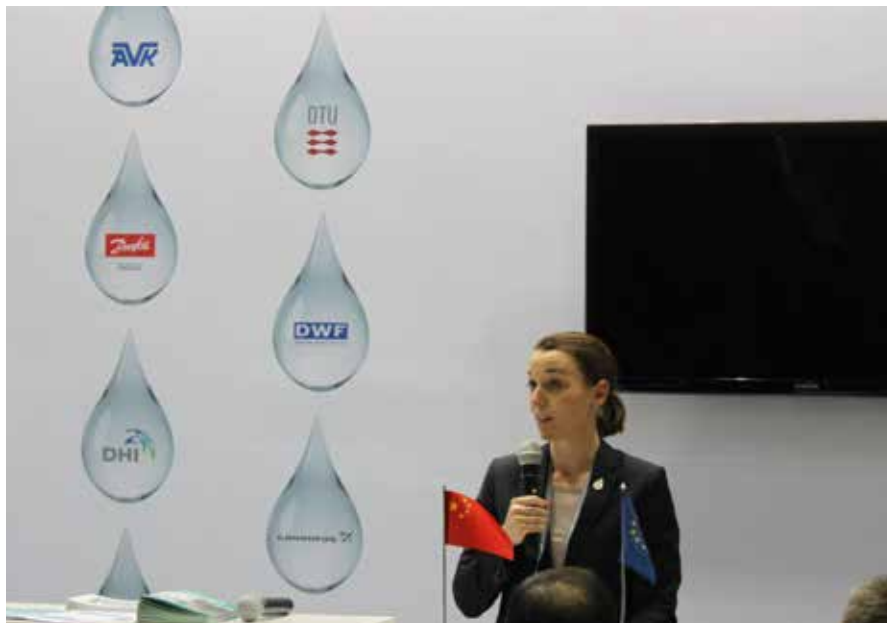
Kirsten Brosbøl, Minister of Environment, during her opening speech at the Danish pavilion World Water Forum

showing that approx. 5 % of the world's energy consumption and up to 30 % of municipalities' electricity consumption are related to water treatment, there is a great potential in Danish companies cooperating to use these experiences in new and different settings. This includes a great potential for AVK.