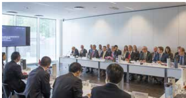
At Confederation of Danish Industry, danish companies presented Smart Water Management solutions in terms of what can be offered to the Chinese market.