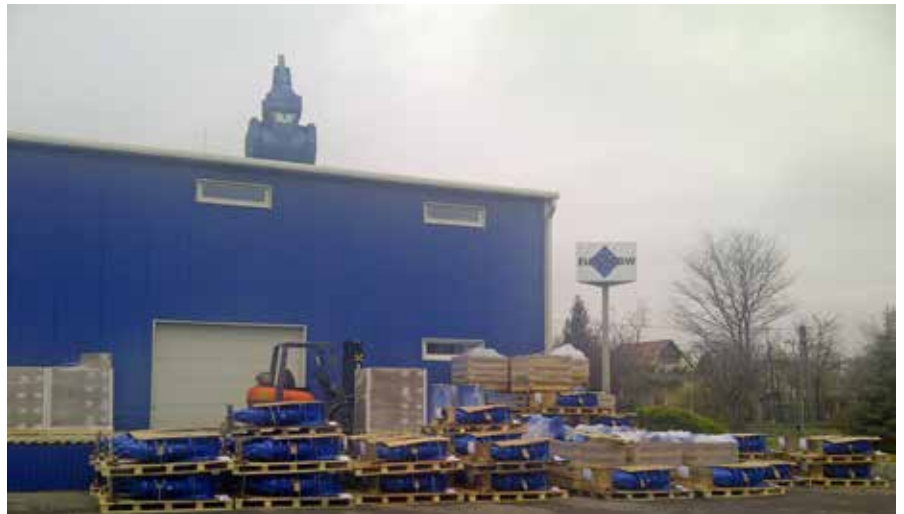
AVK valves on EUROFLOW premises, just upon arrival from Denmark (photo taken with mobile phone).

Drinking water quality improvement in Hungary means replacement of old and mainly asbestos cement pipelines to new HDPE and ductile cast iron pipes together with installation of new valves and fittings on the entire network.