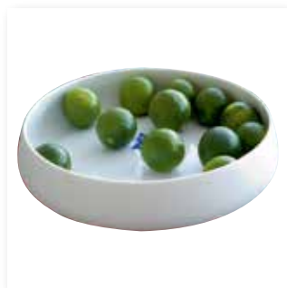
Bowl from TripTrap, Ø32 mm