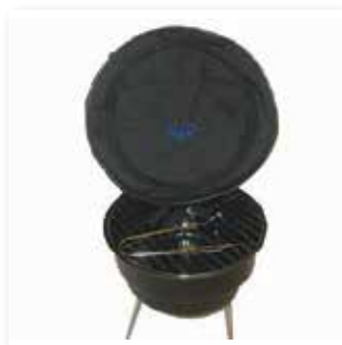
Picnic grill in a cooler bag