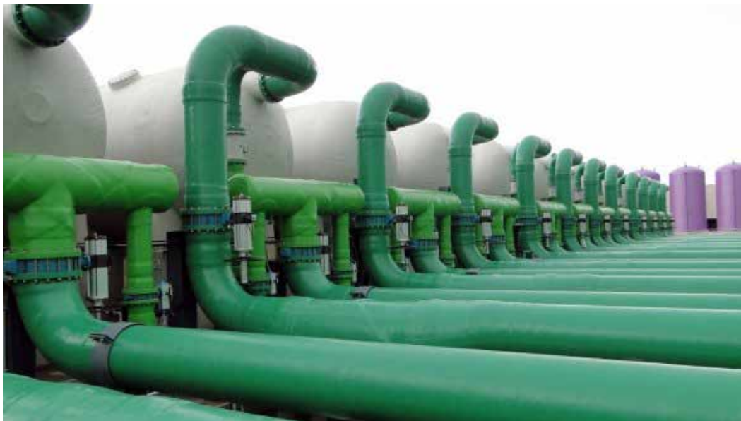
View of the high pressure sand filters

Dalias is a little coast town in Almeria, Andalusia in the south of Spain, close to Granada. The area is one of the driest in Europe. Still, the subtropical desert climate, the arid soils and water shortages have not been an impediment to Almeria farmers and through hard work they have turned the area into the orchard of Europe.