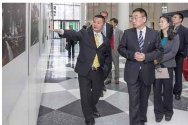
In the entrance hall at Confederation of Danish Industry a photo session was presented to the Chinese minister, showing Denmark looking at China, and vice versa, (China looking at Denmark).

When this Danish pioneer project in Jinan has been completed it will be a reference project not only in China but in the entire Asia.