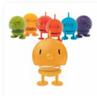
Hoptimist in yellow