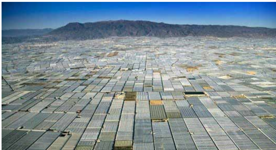
Panoramic view of the intensive agriculture in Almería

The delivery from AVK VALVULAS in this project was more than 700 butterfly valves with actuators and other AVK products.